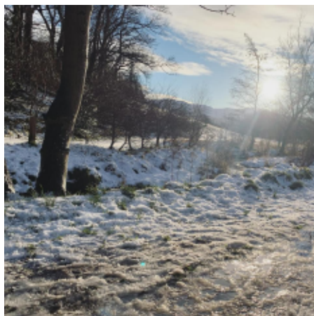
Our beautiful park!

Most subscriptions are renewed in January and many members will already have done so. If you haven't, please do not delay! Whether you have or haven't, if you are in the habit of paying by cash or cheque, please consider setting up a standing order for future payments. It makes administration easier for us; and will mean there is one less thing for you to remember! You will find a mandate to send to your bank on our website. It contains the FOBVP account details which you'll need if you prefer to set up the payment through online banking.