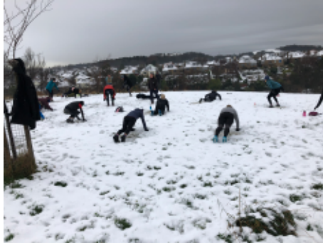
Snowy MacFit classes