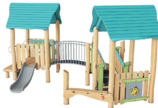
Play Equipment and site location