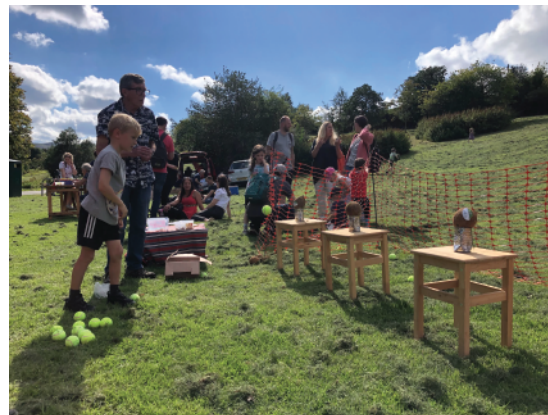
Some pics from Tea in the Park: the famous Duck Race; the Dog Show and the Coconut Shy