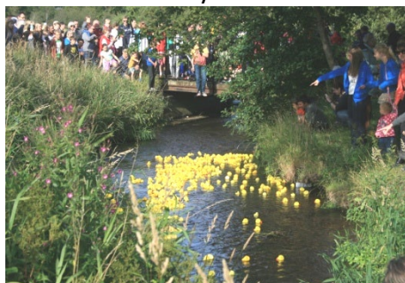
Ducks stream towards the finish