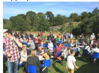
And the sun shone