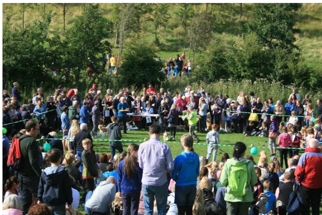
What a lot of people

The 2015 Tea in the Park featured the first Dog Show in the Park for over 50 years. We thought that we would re-introduce this Braidburn Valley Park tradition and we succeeded beyond our wildest expectations with over 150 dogs being entered.