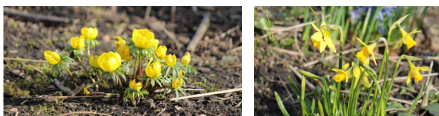
Dianne's Garden in all its early Spring finery