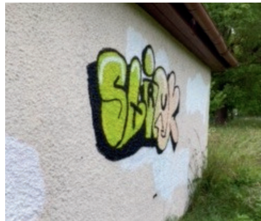
Behind the tram shelter.

Thanks to members reporting it to us, a Friends volunteer can set off - armed with an anti-graffiti kit from the Parks Department.